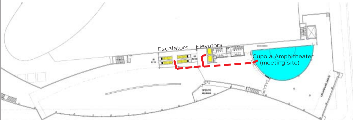
Get off escalators/elevators on 2nd floor and the meeting will be in the Cupola Amphitheater