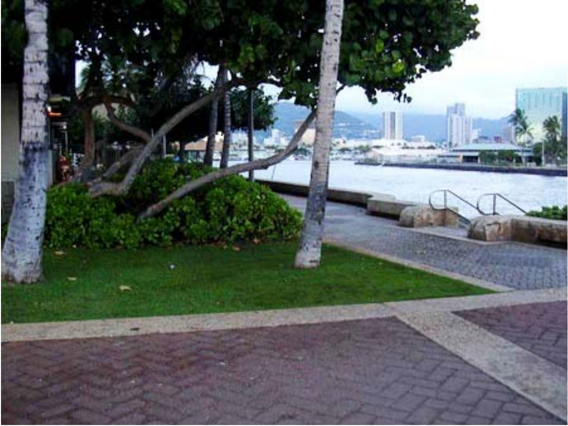
B5-ONE ALTERNATE LOCATION