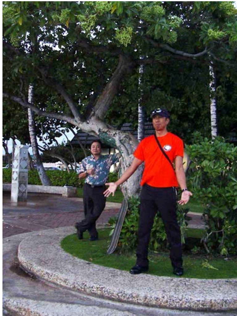
B4-STATUE PLACEMENT REPRESENTATION