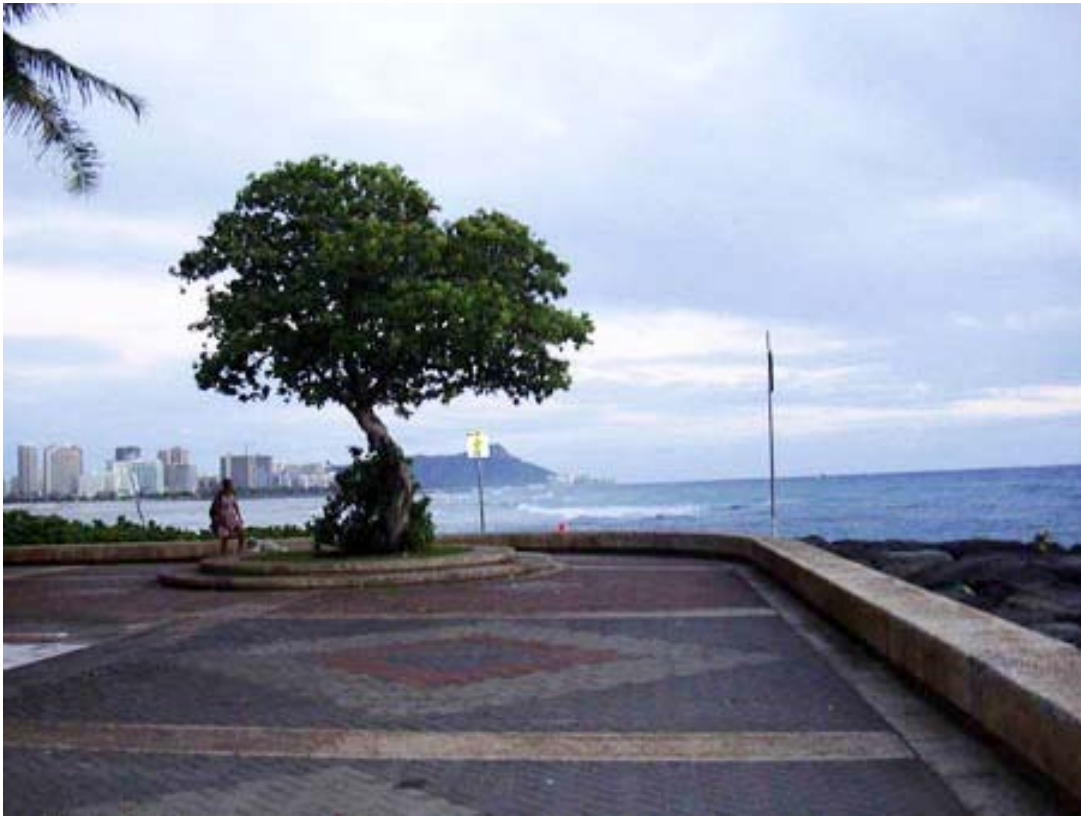
B3-POINT PANIC TREE AND PROMENADE