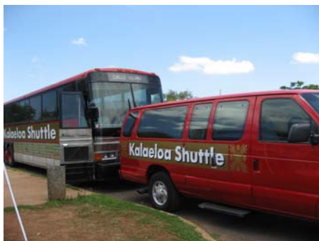
The Kalaeloa Shuttle utilizes a refurbished tour bus and passenger van.