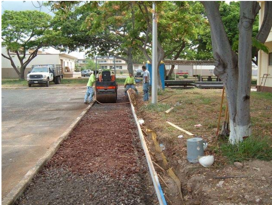
Compaction of backfill for new concrete sidewalk

Installation of additional pipe railings on stair no.1 and 2 is on-going. Removal of existing metal nosing on stair no. 1 is on-going.