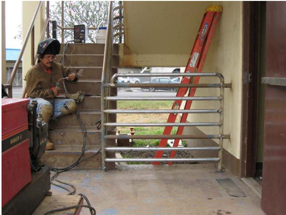
Installation of additional pipe railing at stair no.2