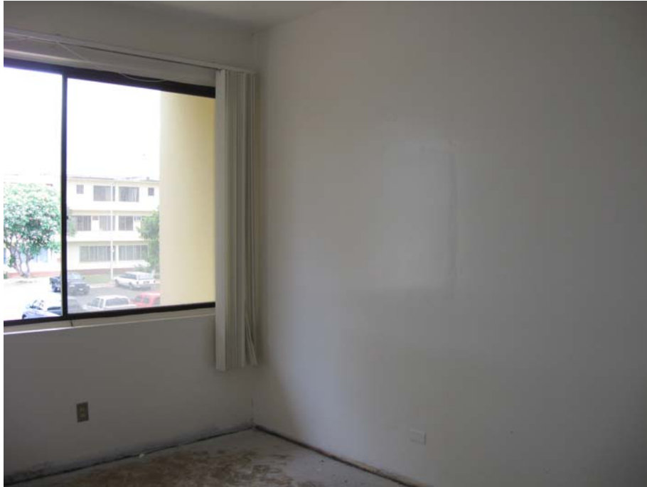
Newly painted walls and ceiling at 2 nd floor rooms